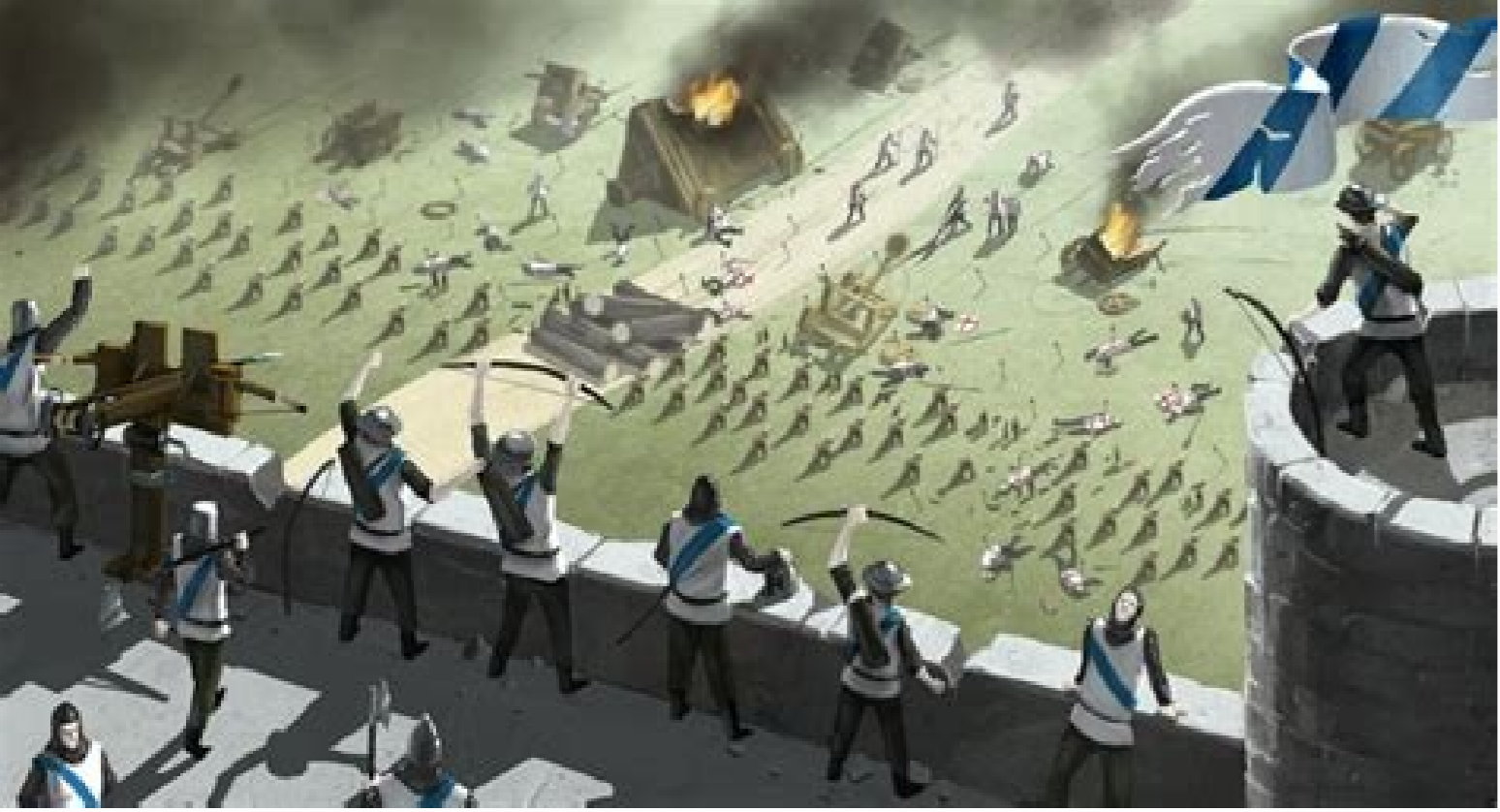
Kingdoms of camelot barbarian raid guide.